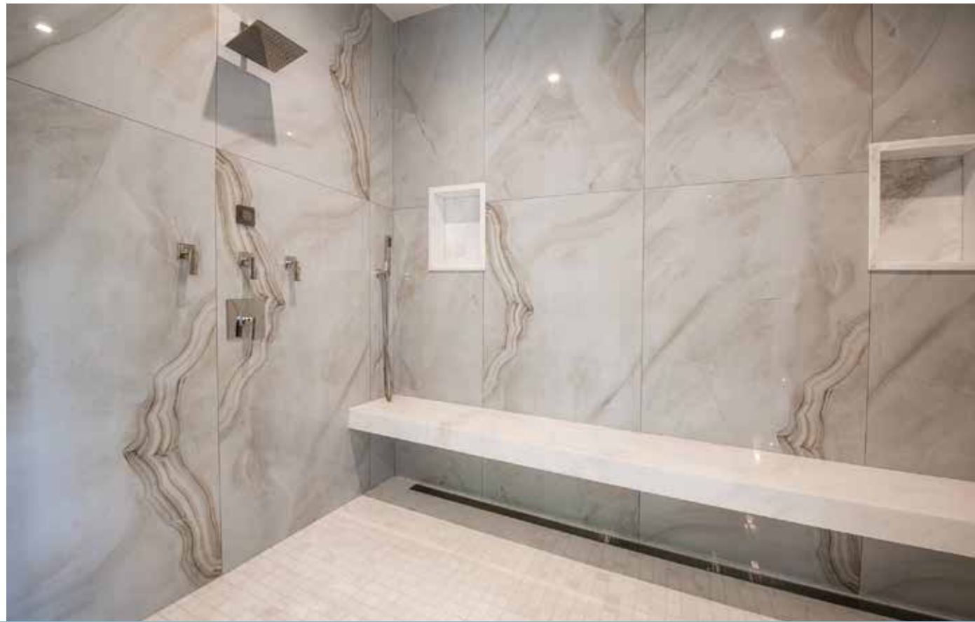
PRIMARY MARBLE SHOWER WITH BENCH SEATING PRIMARY WALK-IN CLOSET