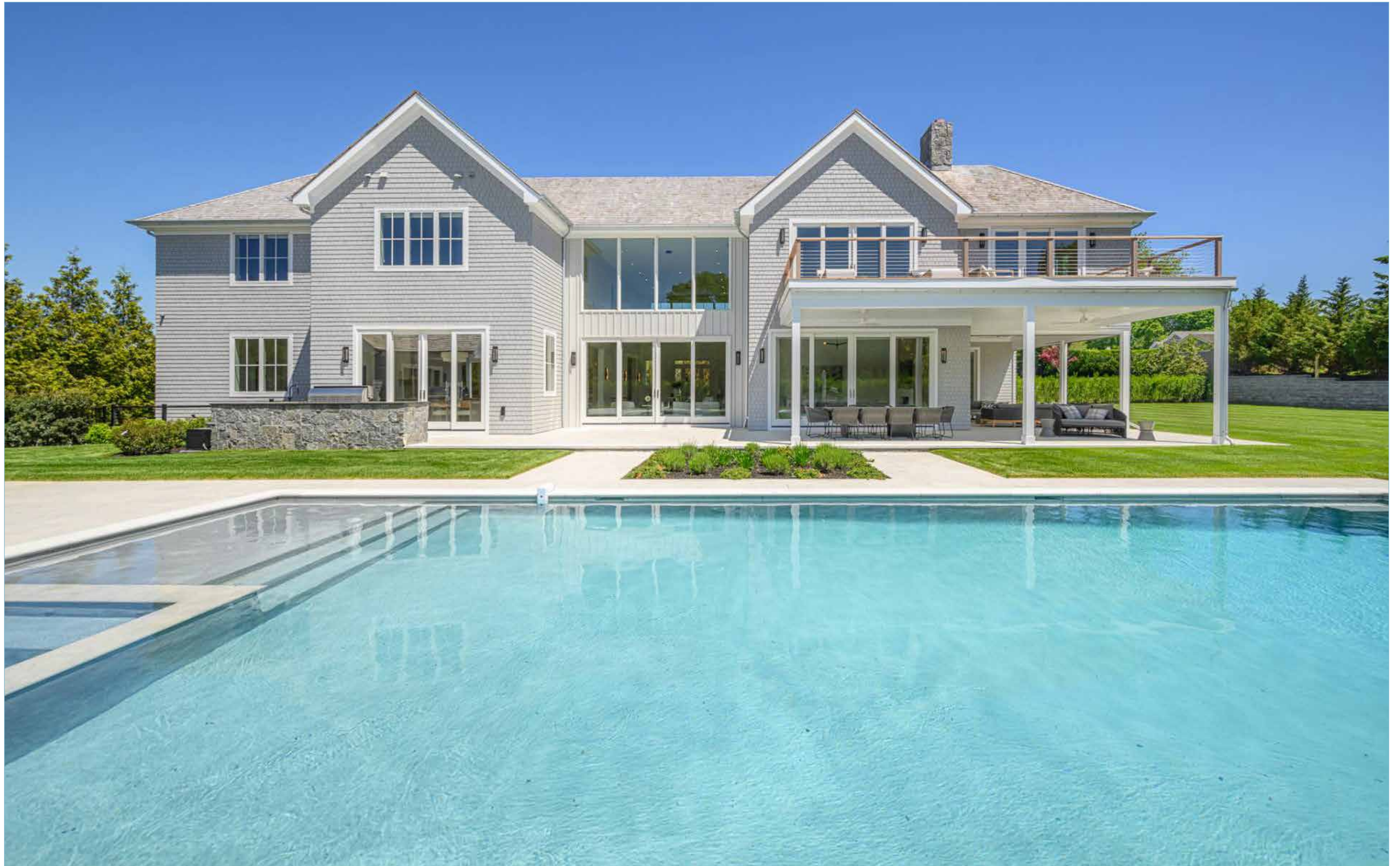
473 North Sea Mecox Road, Southampton