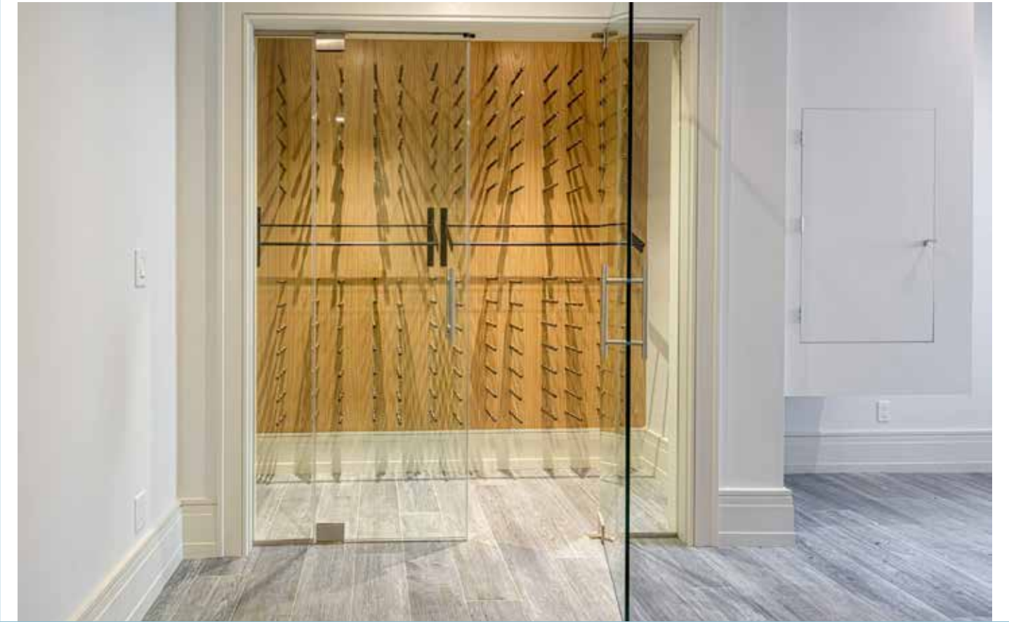
WINE ROOM 3-CAR GARAGE