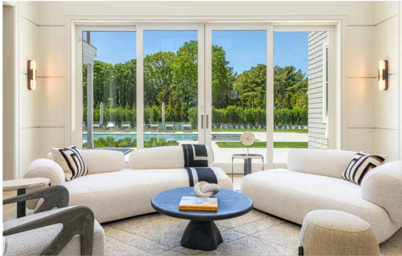
DEN PRIMARY BEDROOM OFFICE