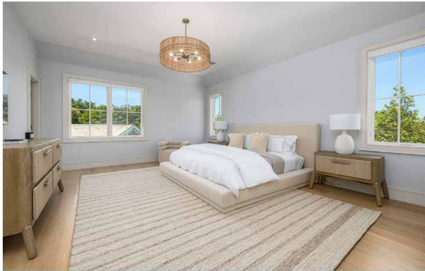
ENSUITE GUEST BEDROOM