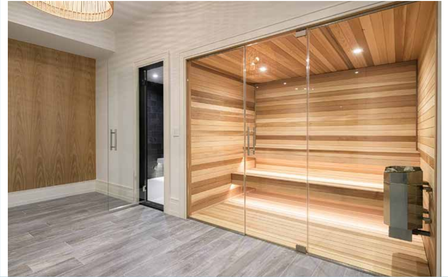
SAUNA AND STEAM ROOM