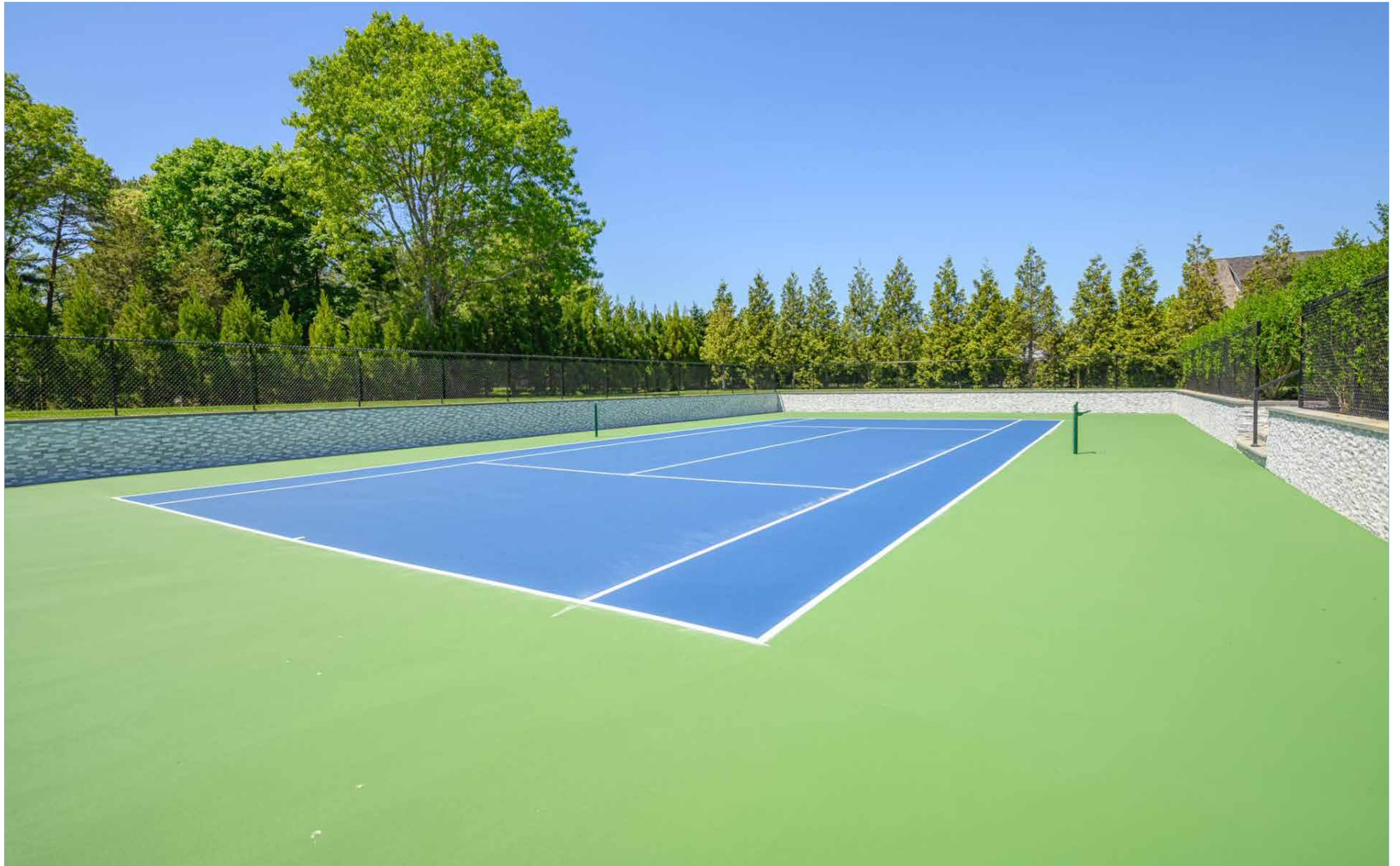
473 North Sea Mecox Road, Southampton