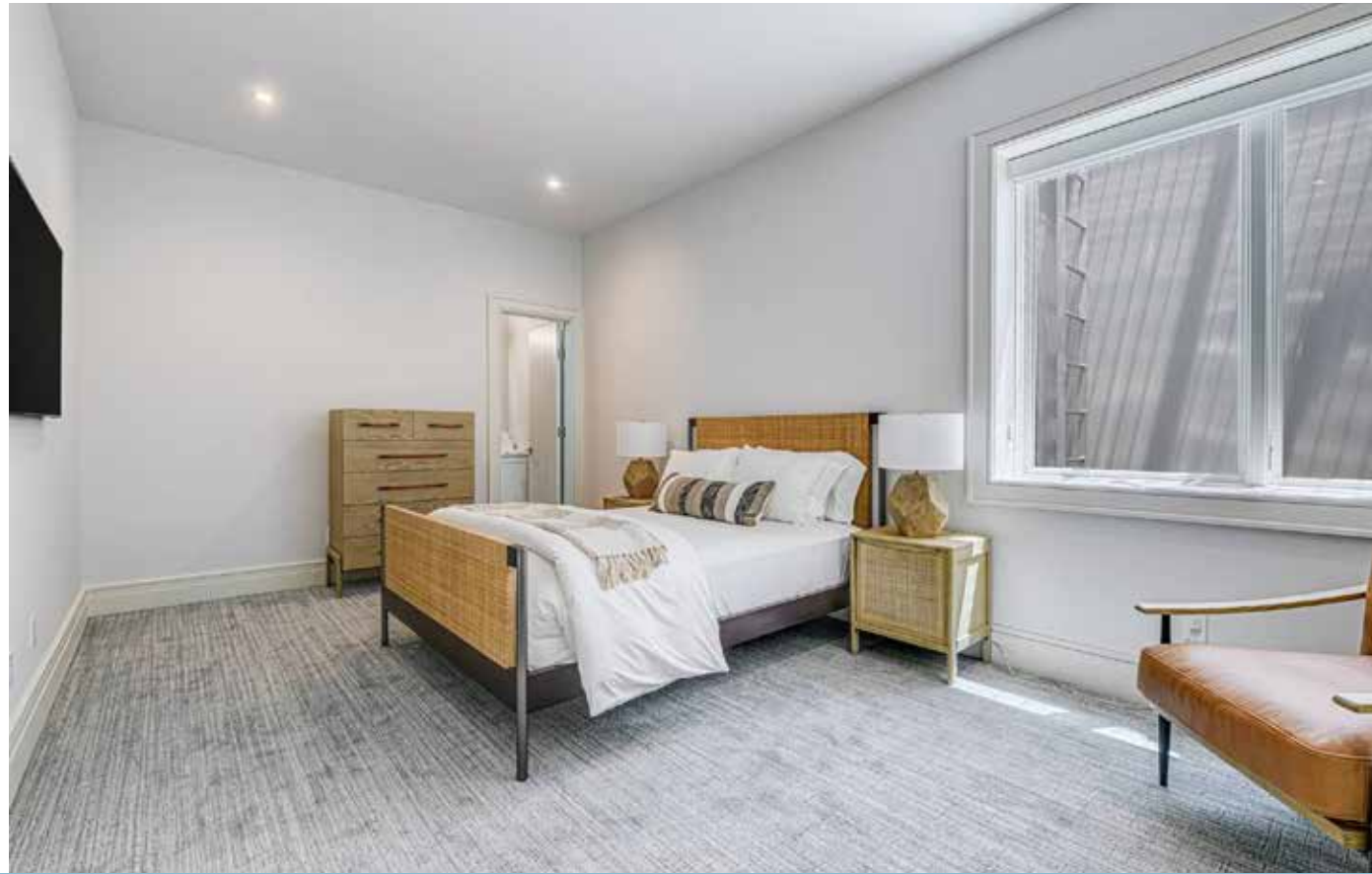
GUEST BEDROOM GYM