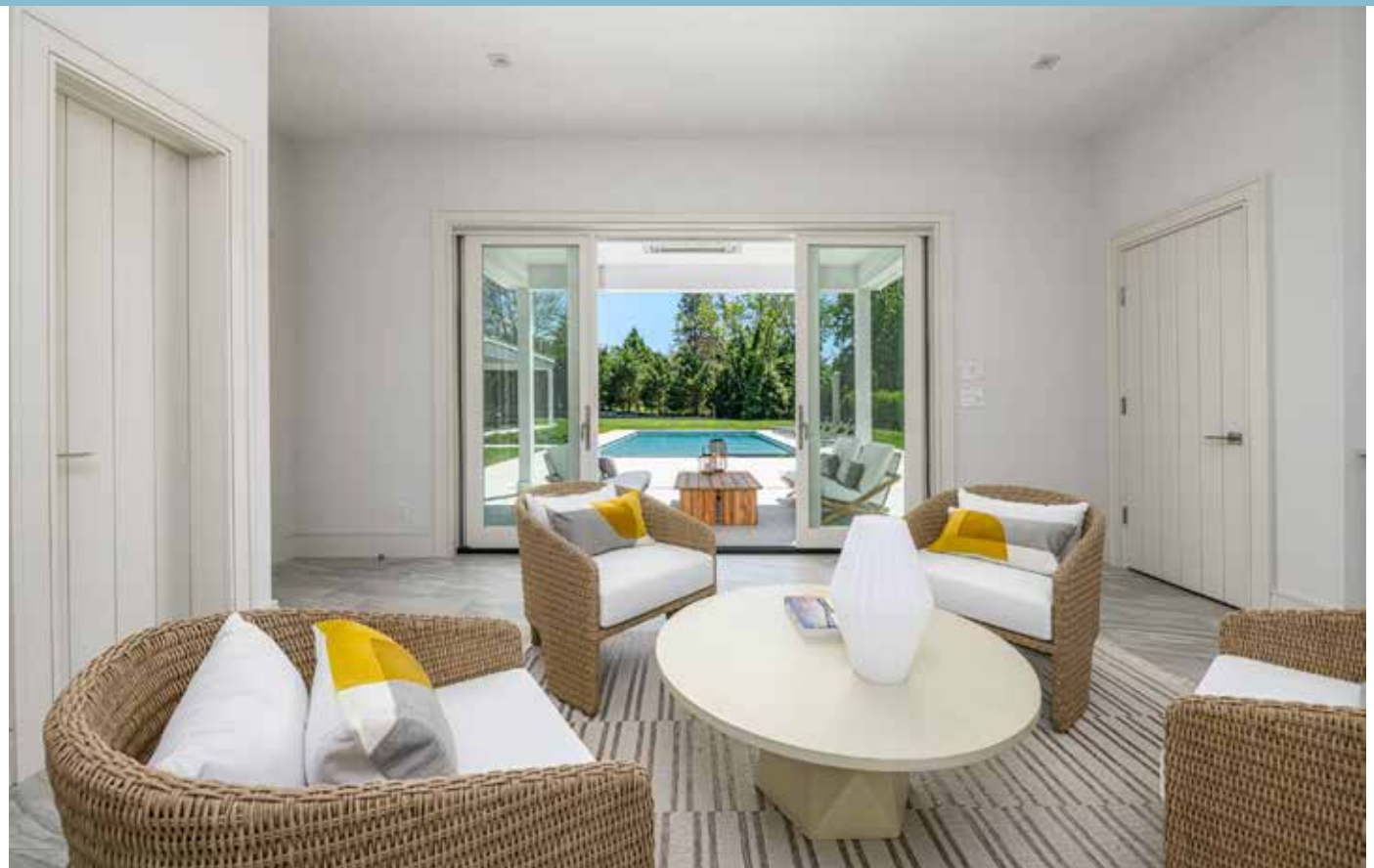
473 North Sea Mecox Road, Southampton