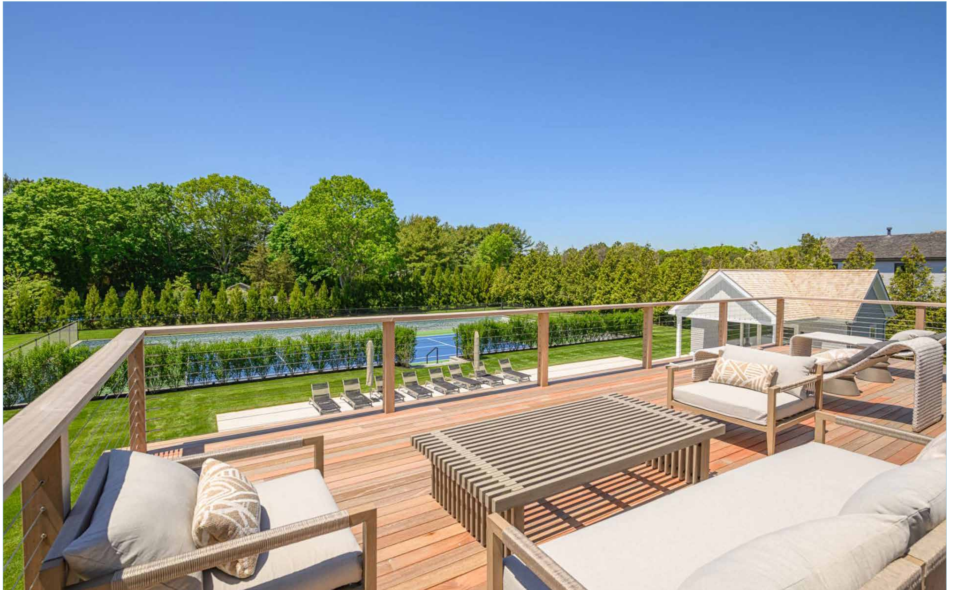
473 North Sea Mecox Road, Southampton