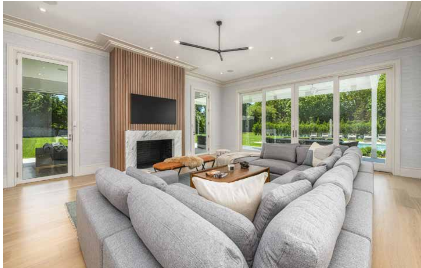
LIVING ROOM DINING ROOM