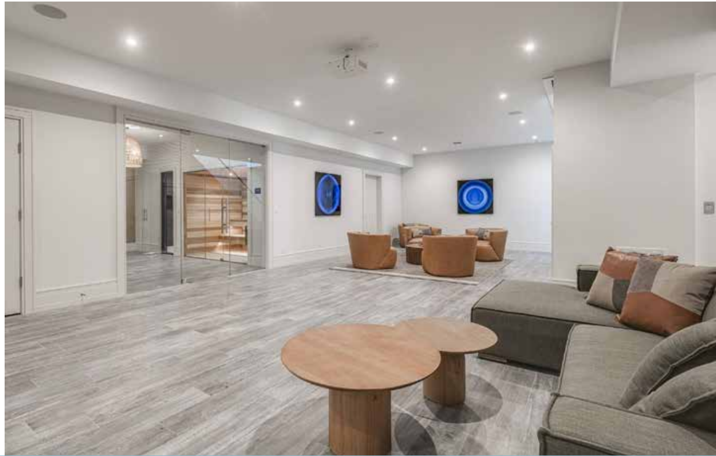
FINISHED LOWER LEVEL MEDIA ROOM