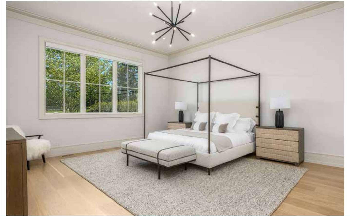
ENSUITE GUEST BEDROOM